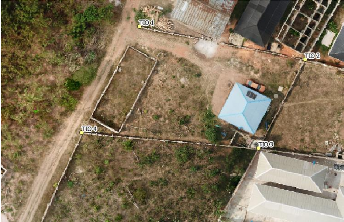
Figure 3.0: Sample Orthophoto Showing comparison points for Toluwani Bakery