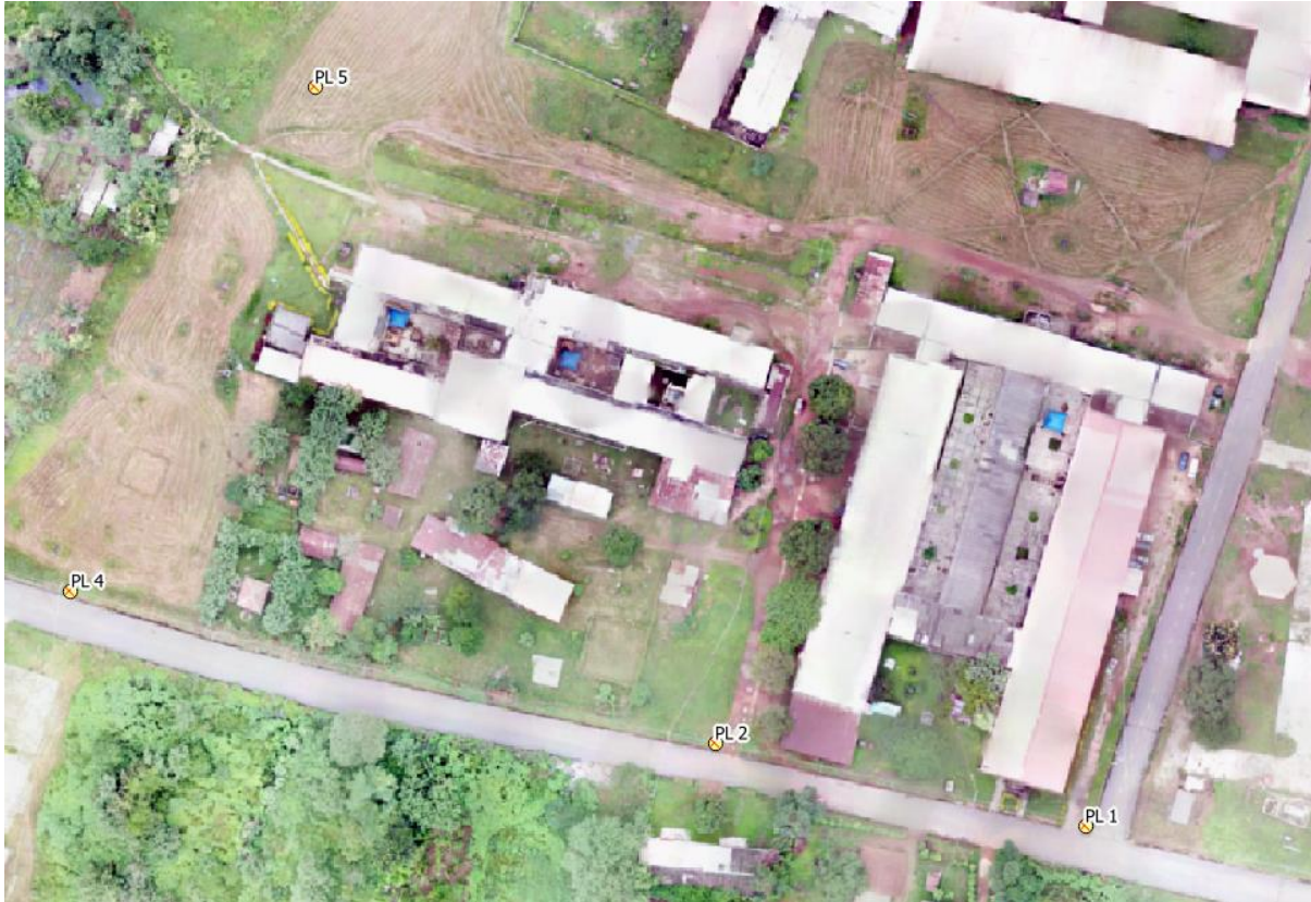
Figure 2.0 Sample Orthophoto showing comparison points for the Old School of Engineering Area